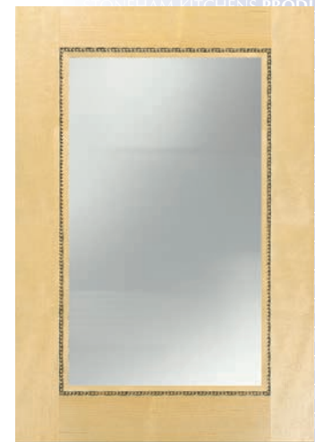
Glass Door. Maple Inlaid. Masterpoint Glass.