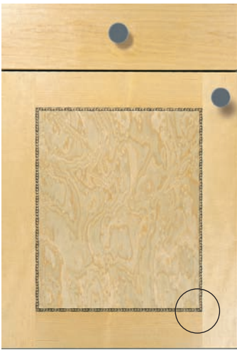
Maple/Birds Eye Inlaid 147

A. As solid/veneer will mellow with age, we recommend integral veneered end panels/plinths to ensure close colour co-ordination over the long term. Extra charges apply. (Refer Section 7).