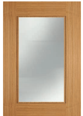
Glass Door. Oak Inlaid. Masterpoint Glass.