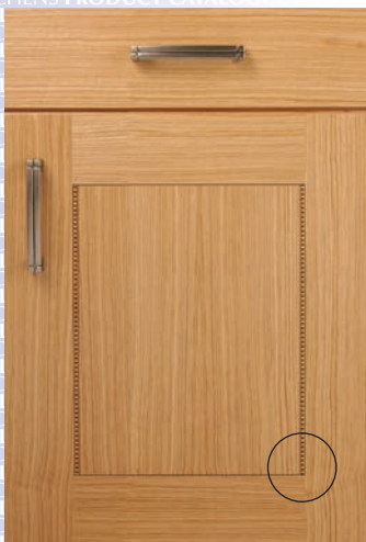
Oak Inlaid 540

A. We strongly recommend that exposed end panels are specified as integral veneer style. These should be specified as an extra charge (Refer Section 7).