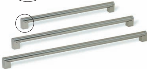
OD22 Steel Bar Handles. Sizes: 160mm centre, 337mm centre, 655mm centre.