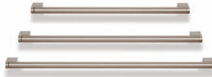
OD14 Steel Bar Handles. Sizes – 160mm, 337mm & 655mm centres (ref. 336, 337, 338).