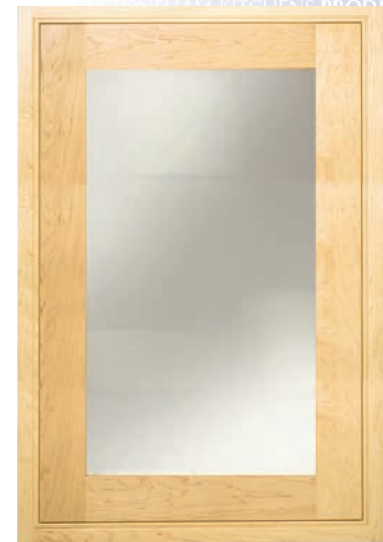
Glass Door. Maple. Clear Glass.