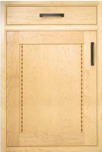
Maple In Frame 502

A. As solid/veneer will mellow with age, we recommend integral veneered end panels/plinths to ensure close colour co-ordination over long term. Extra charges apply. (Refer Section 7).