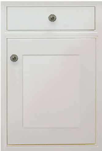
Primed Door 184