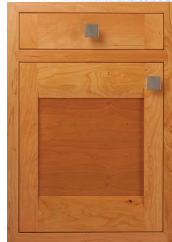
Wild Cherry 501