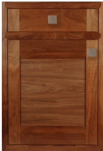
Black Walnut 136