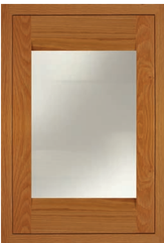
Glass Door – Light Oak, Maple and Wild Cherry. Estrada Glass.