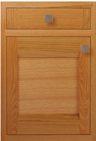
Light Oak 114