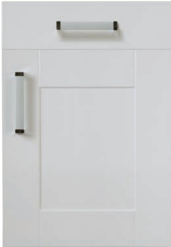
White HG (42)