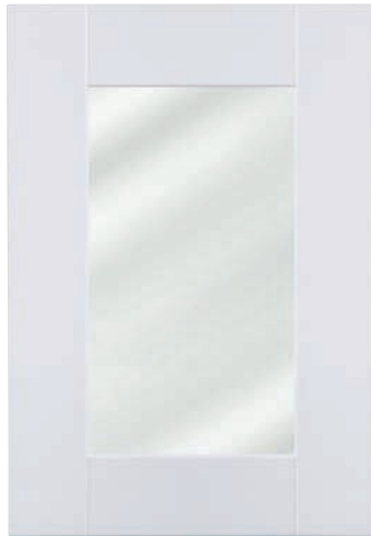
Framed screen glazed