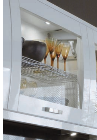
Wall unit bowed front 720 x 1000 mm door only