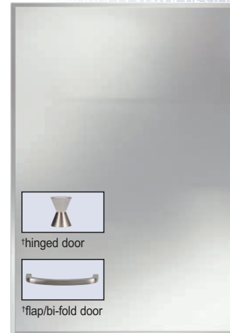
Glass Doors: 1 Aluminium masterpoint;