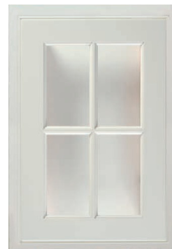
Glass Door. Primed. Clear Glass (with cross bar).