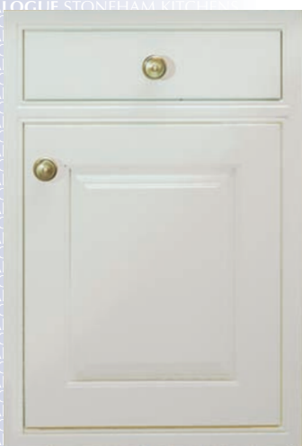
Primed Door 184