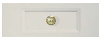
Optional raised and fielded drawer front (SCOT6D)