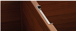
Edge Inset Handle. 233 (96mm Centre/135mm overall)